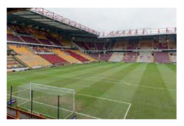
Which club plays at the ground pictured?