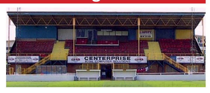
The Camrose Stadium, Western Way, Basingstoke, RG22 6EZ

your right. At the next roundabout take the fifth exit onto Western Way. At the mini roundabout turn right into the club car park entrance.