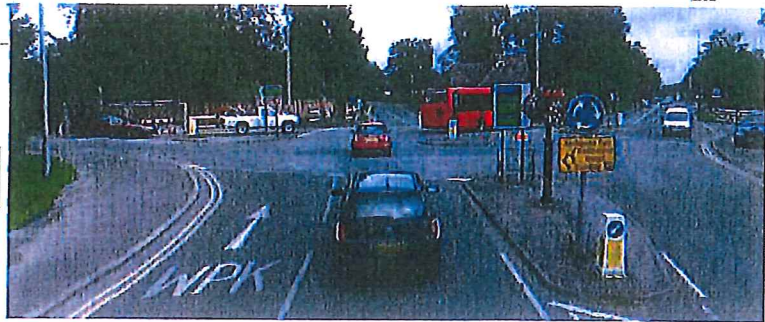
Above - Entrance into Wilton Park (WPK) via A40 (straight across)